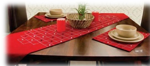
Product Portfolio from the Design Intervention

Most of the products made at Uravu were earlier marketed/ shipped without proper unit and bulk packaging. Under the project, AIACA introduced appropriate primary packaging, visibility of the products thus strengthening the marketability substantially. Packaging intervention was done for a range of bamboo products: Bamboo pens, laptop cool pads, mosaic trays (different sizes), clock, bamboo jewellery, especially necklace sets, hut lamp, make-ur-hut, eyes lamp, pineapple lampshade, book of spices, and gift pack of thorn candle holder. For Uravu understanding about raw material quality and pricing was strengthened depending on the feedback from the market. Uravu received a positive market response especially because of good packaging and reduction in breakage.